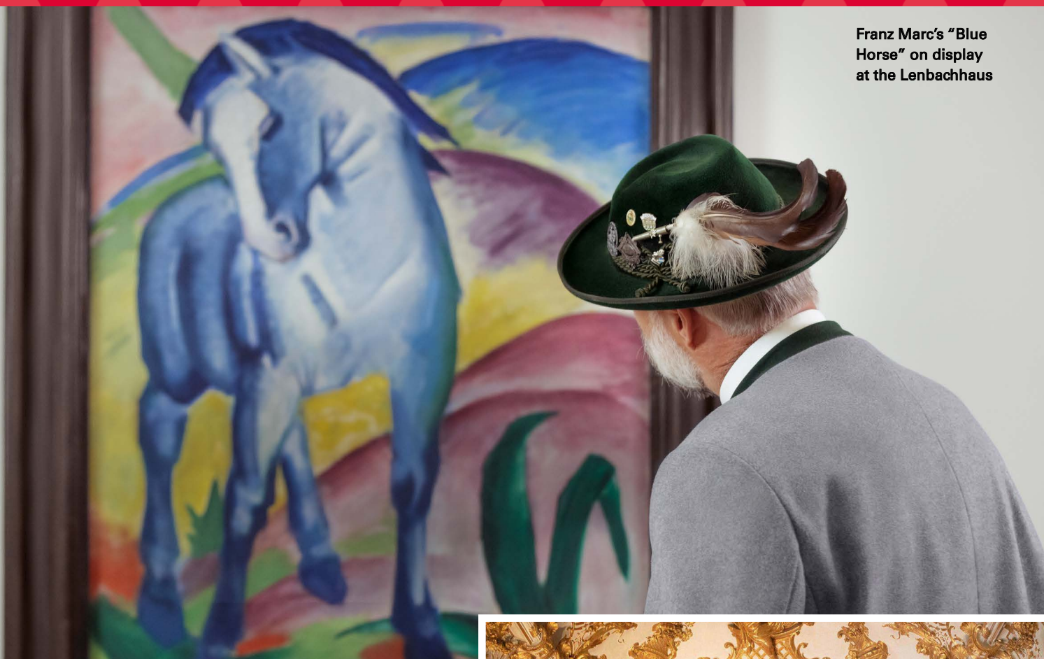
Franz Marc's "Blue Horse" on display at the Lenbachhaus