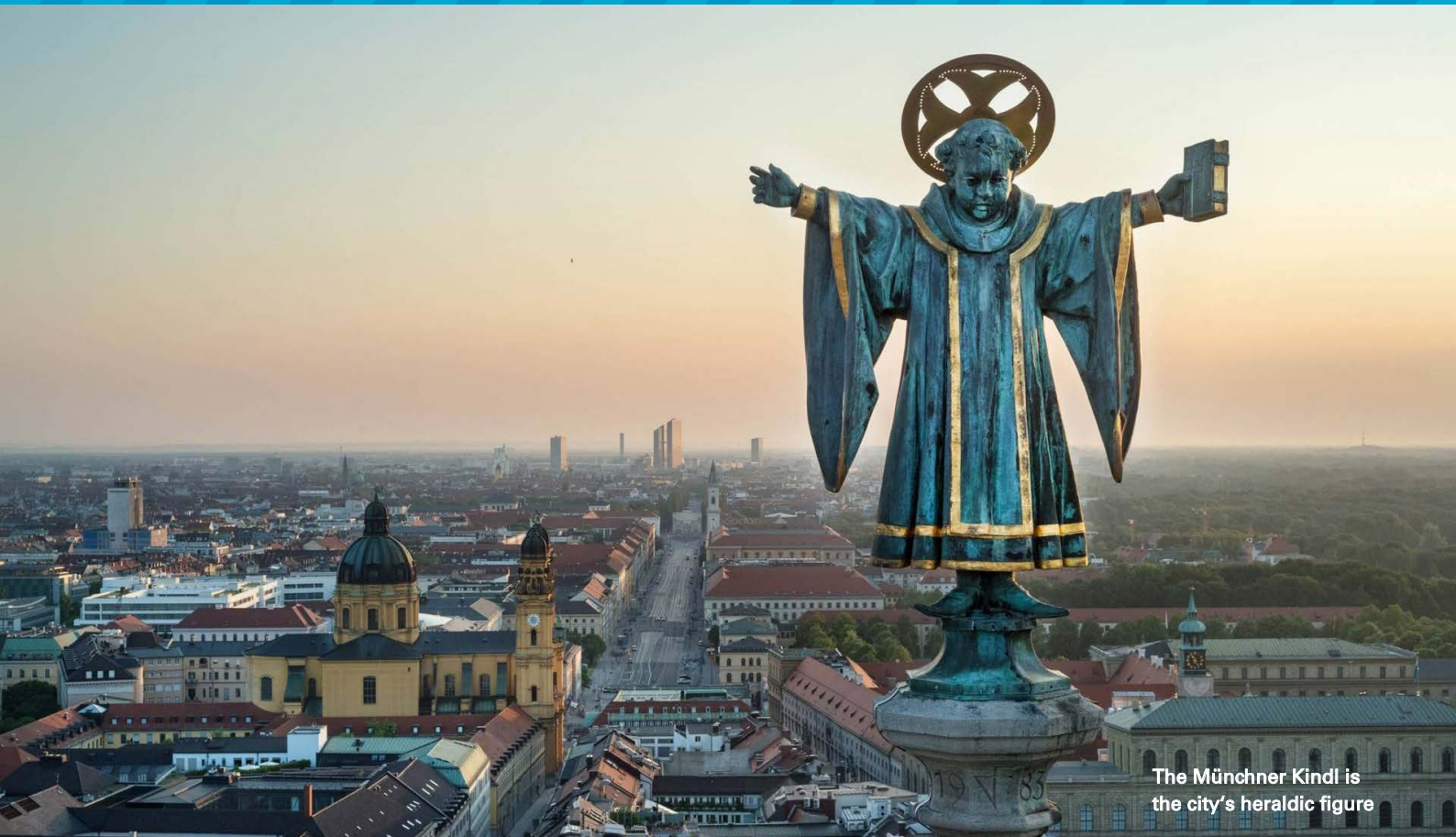
The Münchner Kindl is the city's heraldic figure