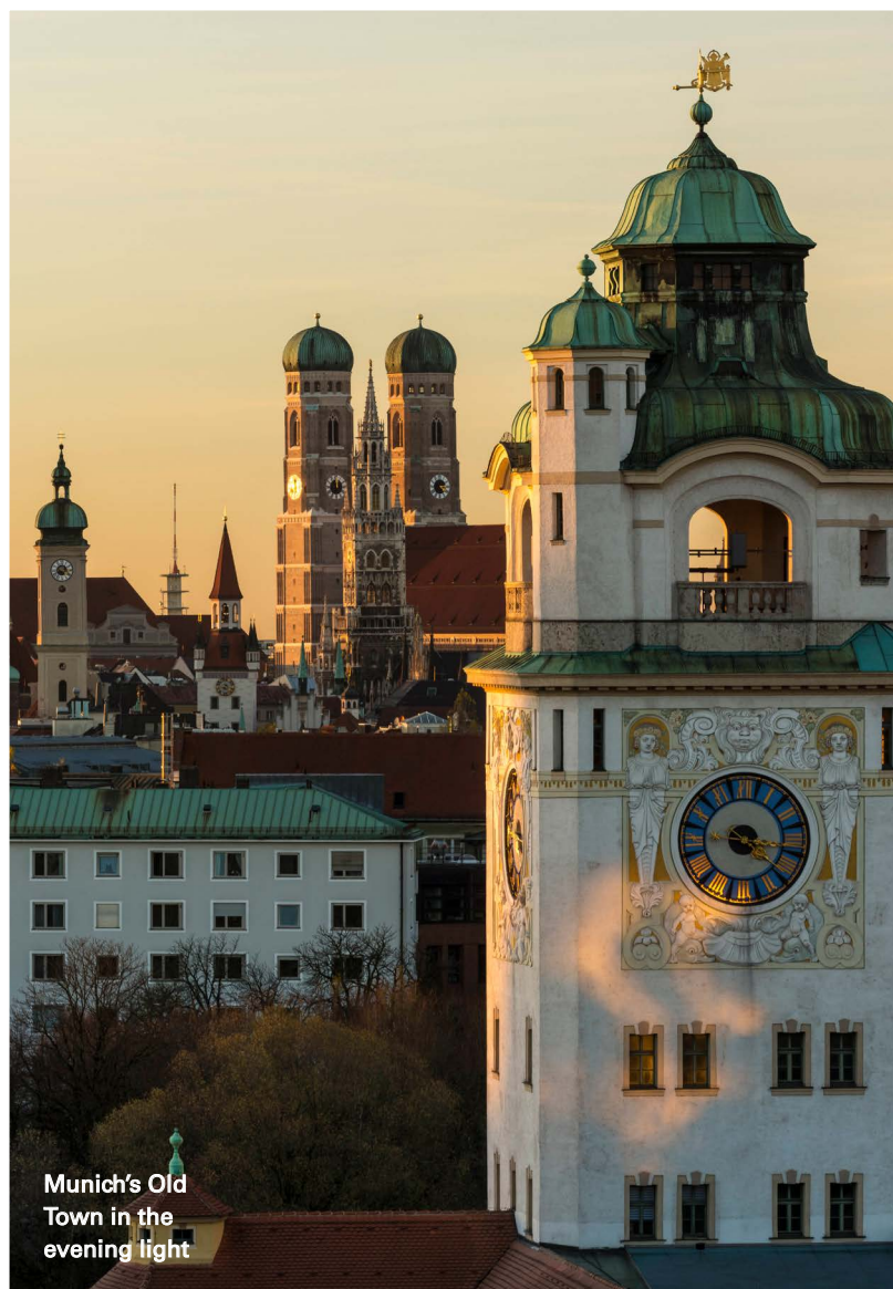
Munich's Old Town in the evening light