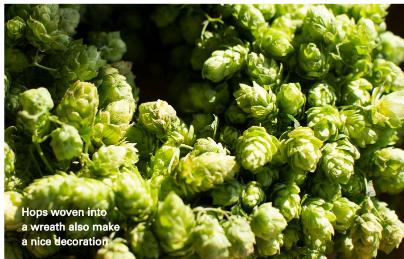
Hops woven into a wreath also make a nice decoration