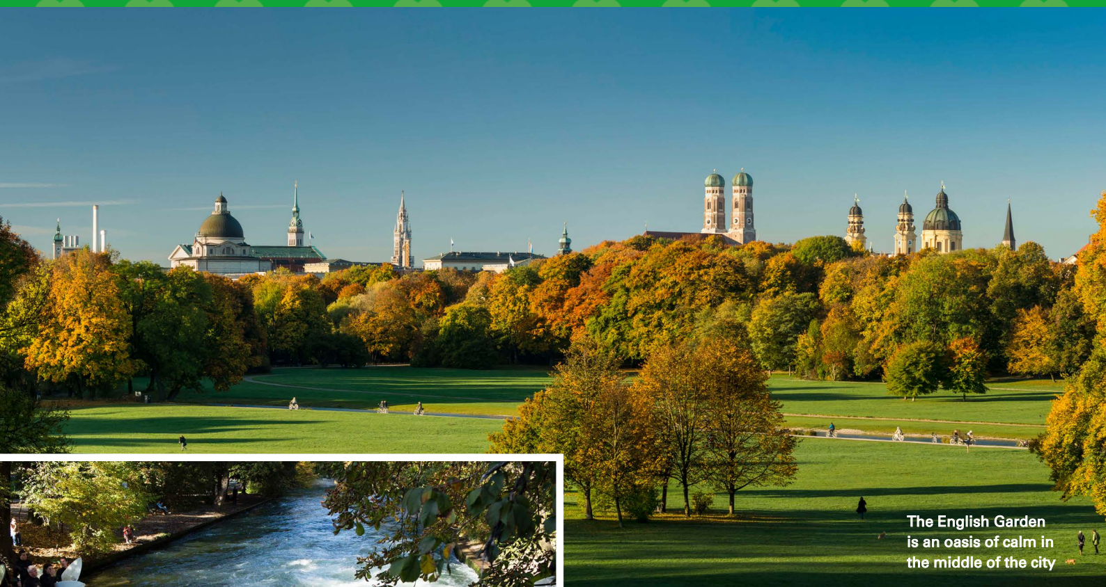
The English Garden is an oasis of calm in the middle of the city