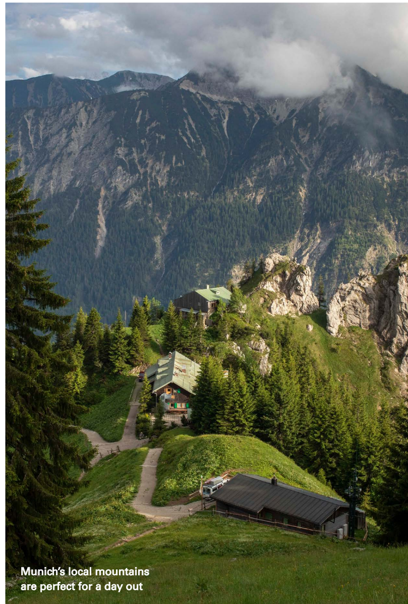
Munich's local mountains are perfect for a day out