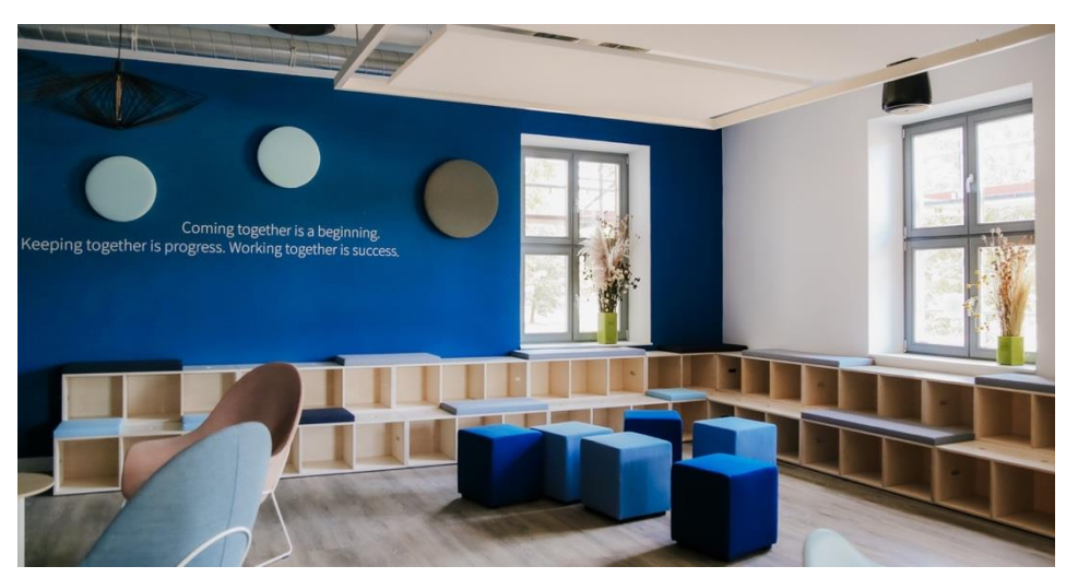
Coworking spaces and more: 1000 Satellites in Munich

Since January 2024, there has been a 1000 Satellites in Gilching-Süd and Soho in Obersendling and in March 2024, 10000 Satellites will open at Theresienhöhe and THE MALT in Allach.