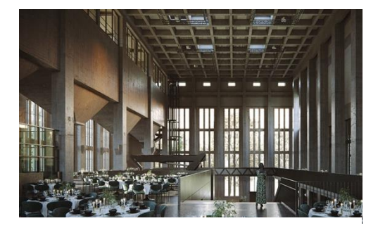
Bergson Kunstkraftwerk; Opening Spring 2024

But it's not just the city center that's changing rapidly. To the west of Munich, Freiham is now one of Europe's largest newbuild districts. A little to the north in Aubing, Bergson Kunstkraftwerk will open in spring as an event location that's unparalleled in the entire region west of Munich. This former heating plant will offer art exhibitions, concerts, corporate events, and restaurants.