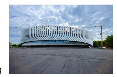
The new SAP Garden opening close by the Olympiapark

And who knows, maybe the business trip can be combined with a top-class sporting event? There'll certainly be numerous opportunities. Munich not only has its own top-league soccer, basketball and ice hockey teams, but will also host some of the preliminary rounds of the European Handball Championship in January and soccer's UEFA European Championship, which is being held at stadiums all over Germany from June 14 to July 14. For esports fans, the League of Legends EMEA final will also be staged in Munich in late summer 2024.