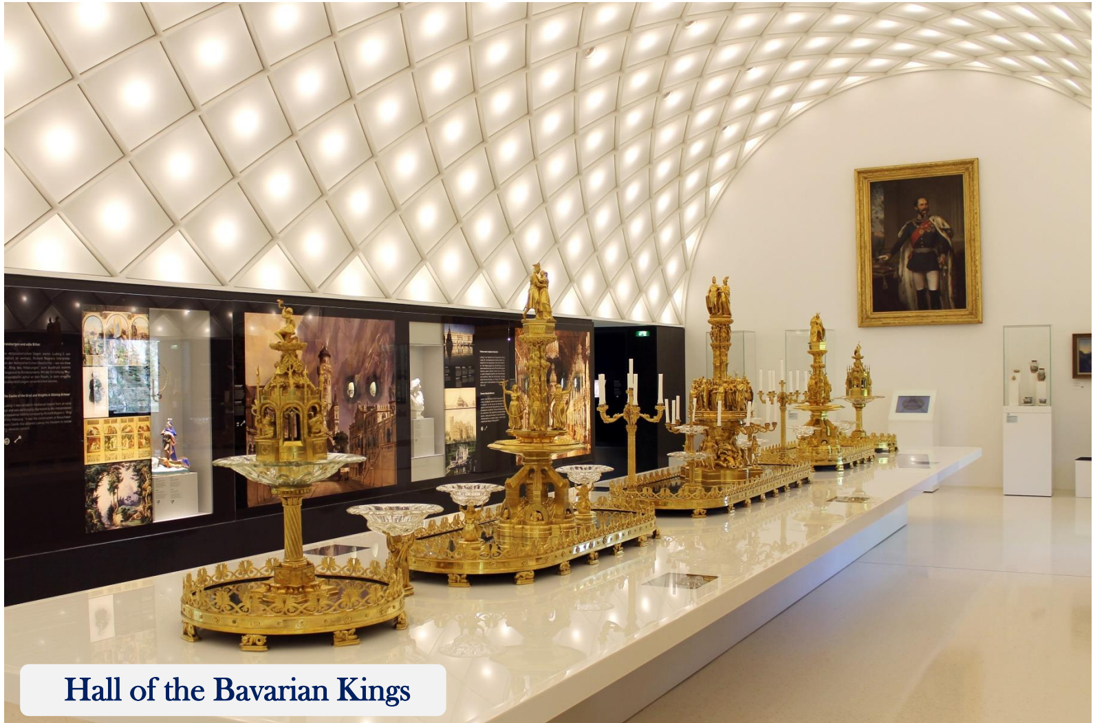
Hall of the Bavarian Kings