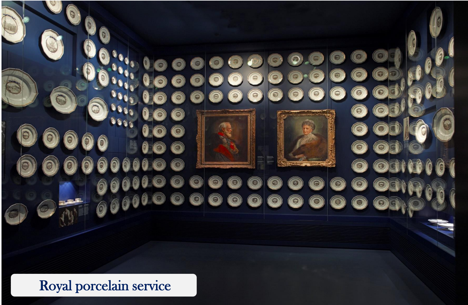
Royal porcelain service