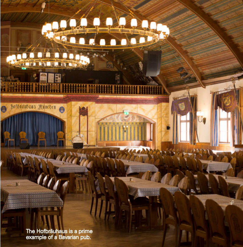
The Hofbräuhaus is a prime example of a Bavarian pub.

Meeting point: In front of the Tourist Information (Marienplatz 8)