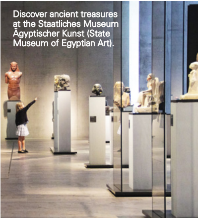
Discover ancient treasures at the Staatliches Museum Ägyptischer Kunst (State Museum of Egyptian Art).