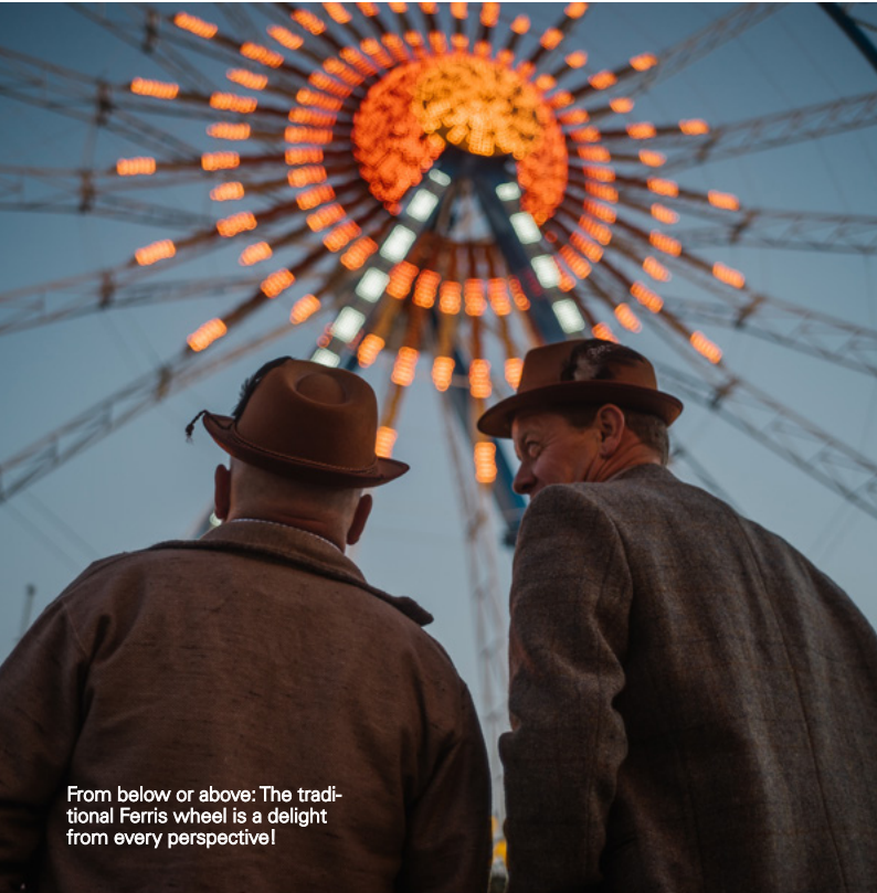
From below or above: The traditional Ferris wheel is a delight from every perspective!