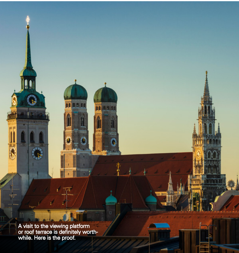
A visit to the viewing platform or roof terrace is definitely worthwhile. Here is the proof.

* More prices and discounts are available online.