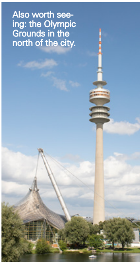
Also worth seeing: the Olympic Grounds in the north of the city.