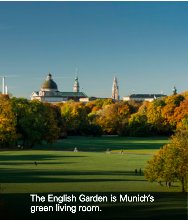
The English Garden is Munich's green living room.