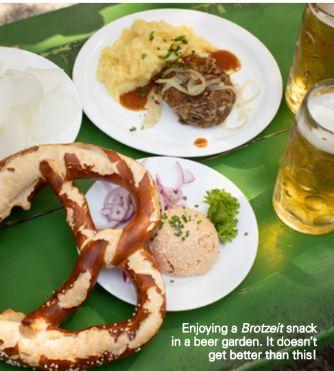
Enjoying a Brotzeit snack in a beer garden. It doesn't get better than this!