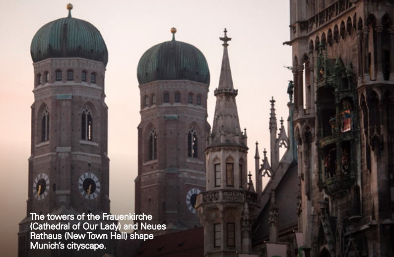
The towers of the Frauenkirche (Cathedral of Our Lady) and Neues Rathaus (New Town Hall) shape Munich's cityscape.