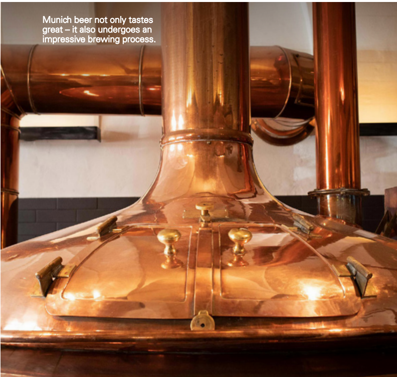
Munich beer not only tastes great – it also undergoes an impressive brewing process.

Meeting point: In front of the Tourist Information (Marienplatz 8)