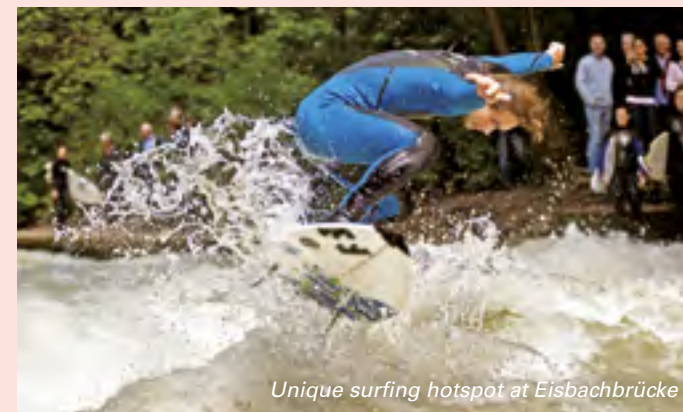
Unique surfing hotspot at Eisbachbrücke

The 13 Deutsches Museum can be seen on Isarinsel, the island to the left. You then cycle straight on into Zweibrückenstraße , passing 14 Isartor as you head into the Tal . Turn right after the Schneider Bräuhaus , onto Maderbräustraße , then right again onto Ledererstraße and then left onto Orlandostraße . Pass the souvenir shops on foot, pushing your bike as far as the 15 Hofbräuhaus am Platzl .