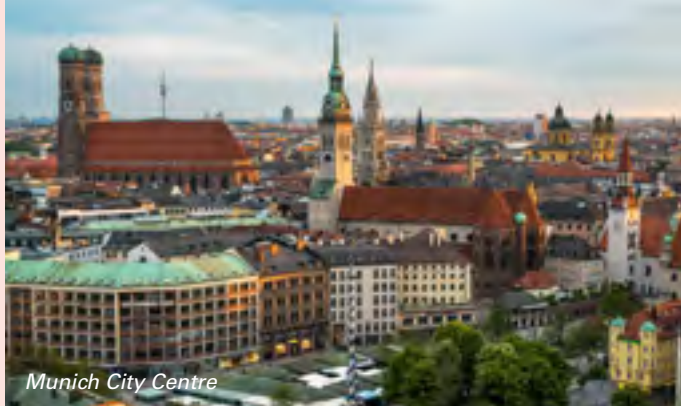
Munich City Centre

TIP: Dancers from the swing, salsa and tango scenes meet at Hofgarten temple .