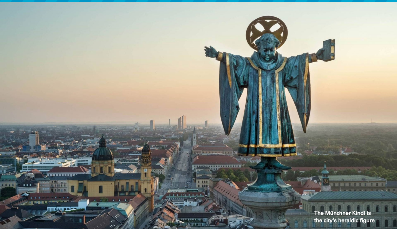
The Münchner Kindl is the city's heraldic figure