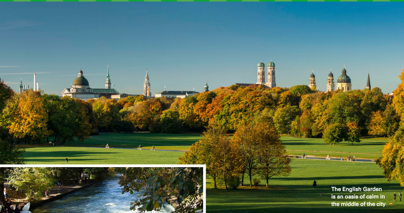
The English Garden is an oasis of calm in the middle of the city