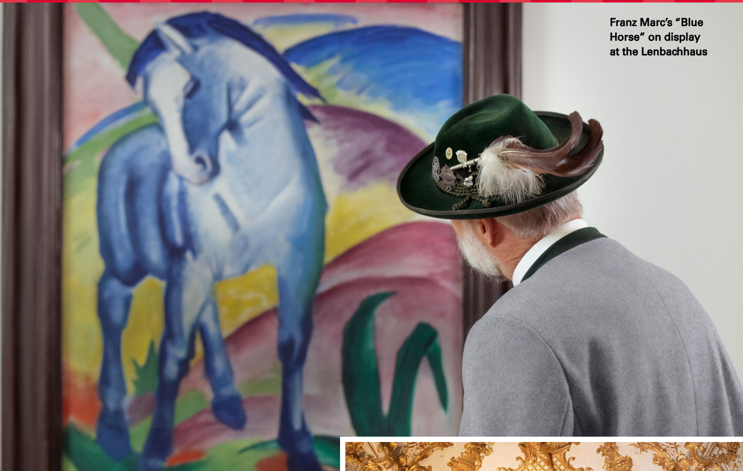
Franz Marc's "Blue Horse" on display at the Lenbachhaus