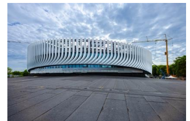
The new SAP Garden opening close by the Olympiapark

And who knows, maybe the business trip can be combined with a top-class sporting event? There'll certainly be numerous opportunities. Munich not only has its own top-league soccer, basketball and ice hockey teams, but will also host some of the preliminary rounds of the European Handball Championship in January and soccer's UEFA European Championship, which is being held at stadiums all over Germany from June 14 to July 14. For e-sports fans, the League of Legends EMEA final will also be staged in Munich in late summer 2024.