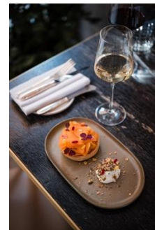
Restaurant Schwarzreiter in Hotel Vier Jahreszeiten