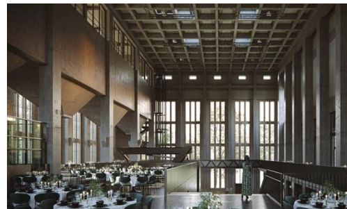
Bergson Kunstkraftwerk; Opening Spring 2024

But it's not just the city center that's changing rapidly. To the west of Munich, Freiam is now one of Europe's largest newbuild districts. A little to the north in Aubing, Bergson Kunstkraftwerk will open in spring as an event location that's unparalleled in the entire region west of Munich. This former heating plant will offer art exhibitions, concerts, corporate events, and restaurants.