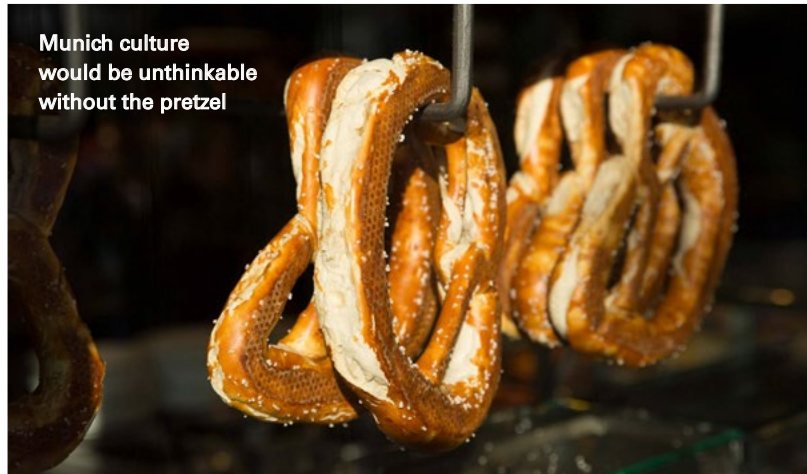
Munich culture would be unthinkable without the pretzel