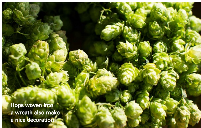
Hops woven into a wreath also make a nice decoration