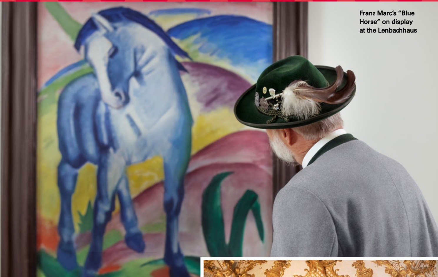
Franz Marc's "Blue Horse" on display at the Lenbachhaus