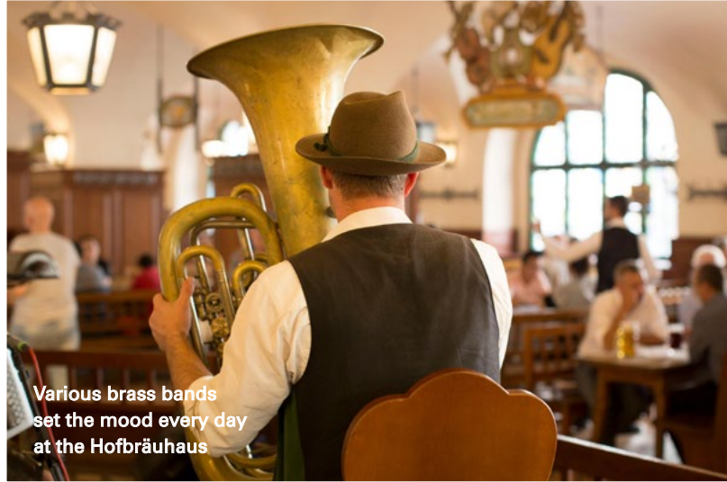
Various brass bands set the mood every day at the Hofbräuhaus